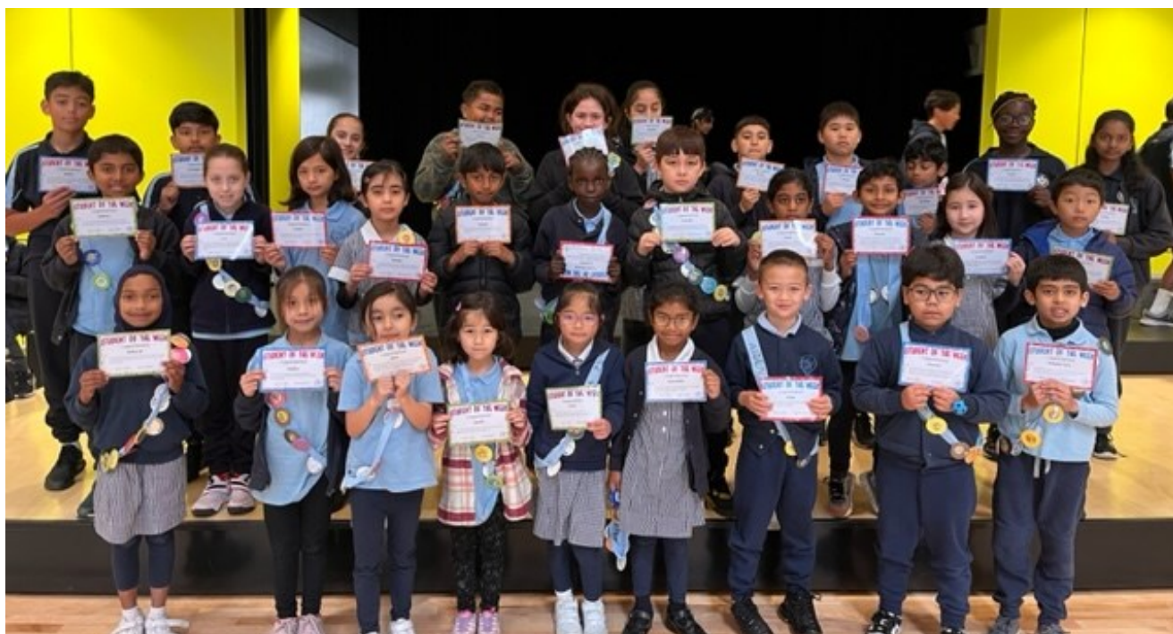
Awarded Monday 23rd October