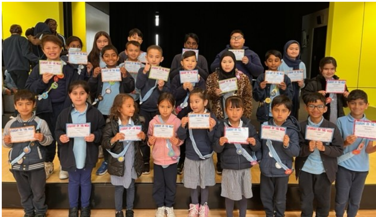
Awarded Monday 16th October

We love to celebrate our students who are not just achieving academically in the classroom but showing our school values of Care, Courtesy, Cooperation and Common Sense. Here are our recipients for the fortnight.