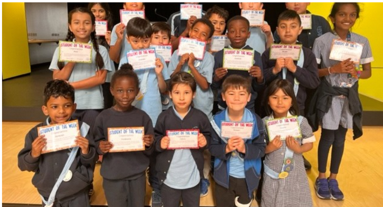
Awarded Monday 6th November