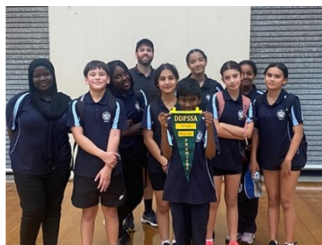
Netball mixed team A

Congratulations to all the Year 6 staff and students who participated in this incredible event. Your hard work and dedication were truly remarkable.