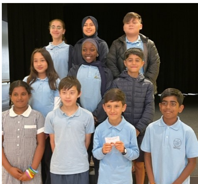
2024 House Captains

* Please note, some students were unavoidably absent from the photo