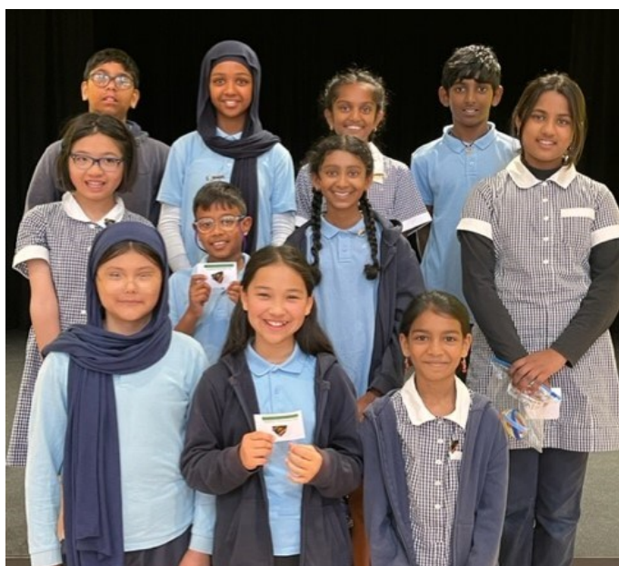
2024 Student Leadership Team